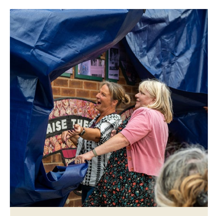
"It's been like a bit of a therapy session. I bet people have gone away feeling a lot better."

— Workshop participant Strong Women of St Helens